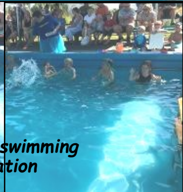
Pod 1 and 2's swimming demonstration